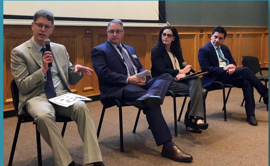
Our Lived-Experience Panel from the Population Health Summit